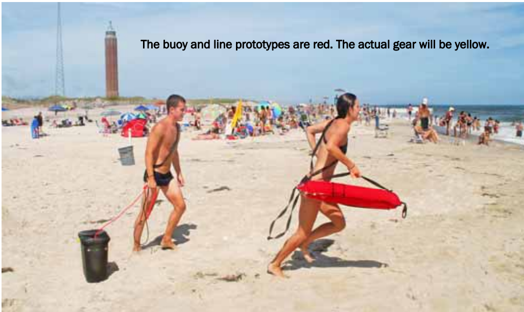
The buoy and line prototypes are red. The actual gear will be yellow.

Editor's Note: Since this gear is under analysis and not available to all crews, it cannot be used for our Inter-Beach Races.